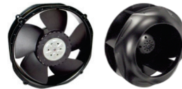
CR 030 & 035