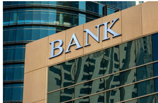
Banking and Financial Institutions