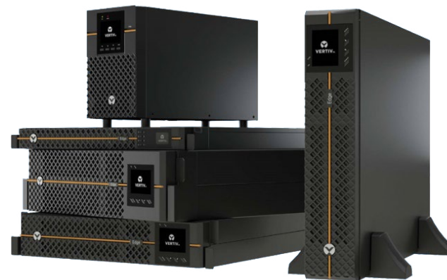
Vertiv™ EDGE UPS