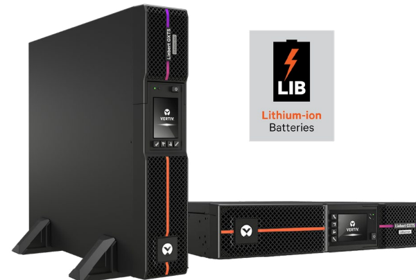
Vertiv™ Liebert® GXT5 UPS